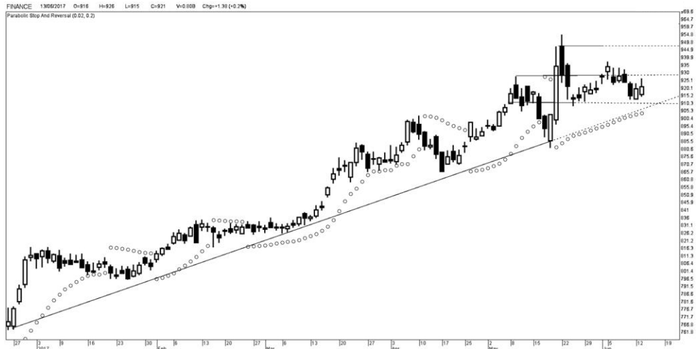
Kinerja sektor keuangan & perbankan

Sementara potensi pertumbuhan BMRI memiliki potensi pertumbuhan tertinggi di bandingkan beberapa saham di sektor perbankan dan keuangan, antara lain BBTN, BBKA dan BBRI